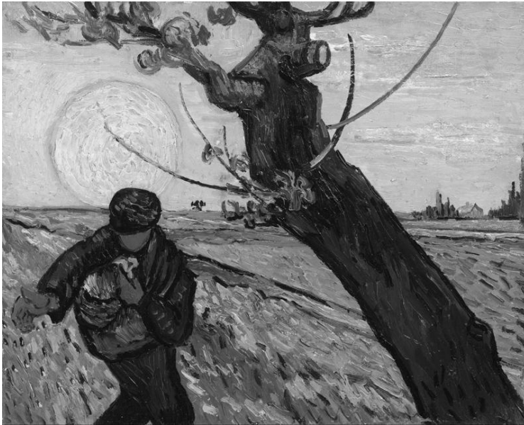
“The Sower III”

JULY 12, 2026 – 10 AM THE 7TH SUNDAY AFTER PENTECOST