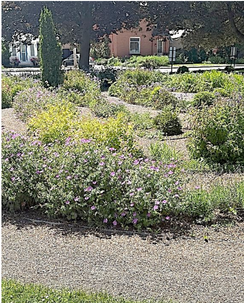
Christ Church labyrinth – July 2026

Please join us SUNDAY for In Person Worship