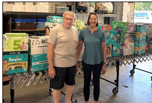
River Falls Food Pantry