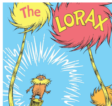
Book: "The Lorax" by Dr. Seuss

Sunday, July 18 th WE ARE STRONGER WHEN WE WORK TOGETHER.