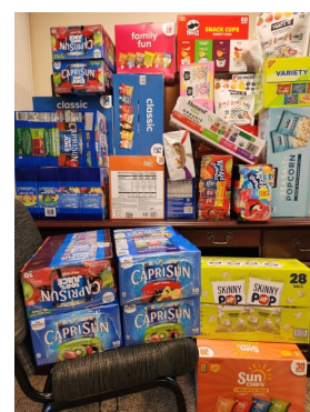
Summer Lunch Program Collection

During the summer months children who rely on free meals at school experience food insecurity. Altrusa and Food 4 All have teamed up to distribute sack lunches at local sites. We have amassed quite a collection of tasty snacks and drinks to supplement the fresh items included in each sack lunch; thank you to all who have contributed! Beginning in July, a group of Altrusa volunteers will use our kitchen on Tuesday and Thursday mornings to make sandwiches and pack the lunches for distribution.