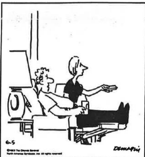
"HEY! I WAS WATCHING THAT EXERCISE SHOW!"