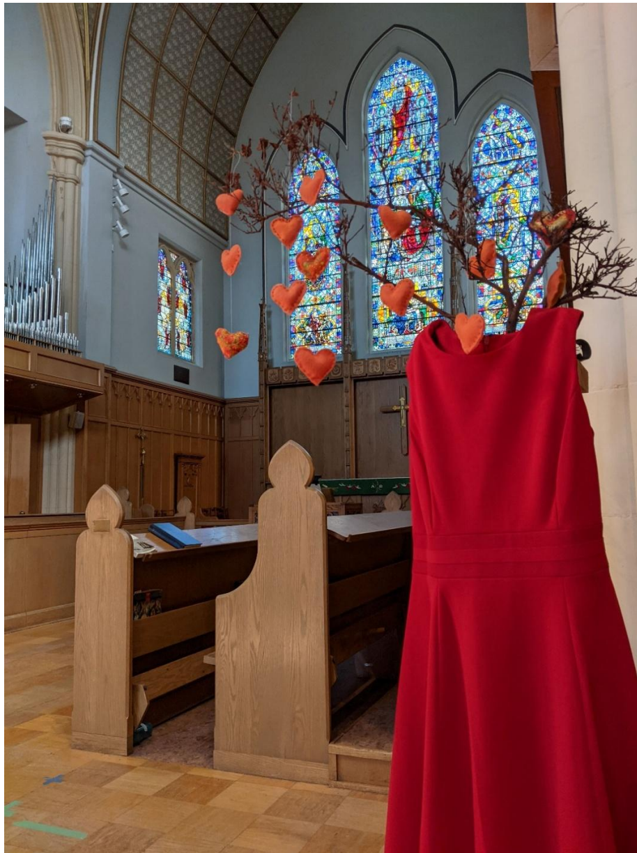
at St. John the Divine, Victoria

We are an inclusive and affirming parish; the sacraments of the church (baptism, communion and marriage) are available to all people on equal terms. Christ welcomes you, and so do we.