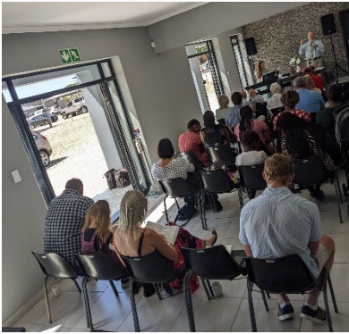
Solid Rock Baptist Church 2023