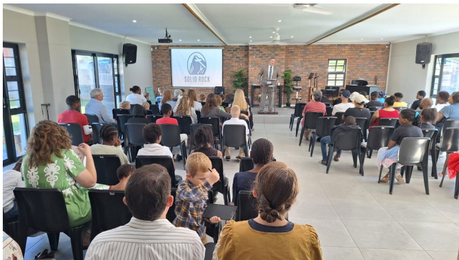
Solid Rock Baptist Church 2026