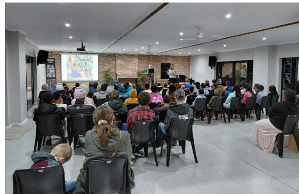
Friday Night Youth 2026