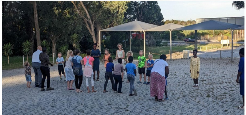
Friday Night Youth 2023