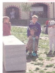
Me in Greece with some