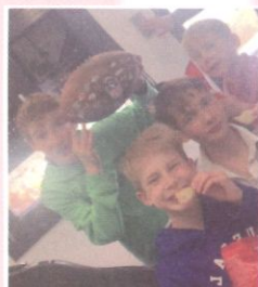
Brothers are the best.