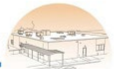
BUILDING FUND gifts go toward Northwest Roof repairs