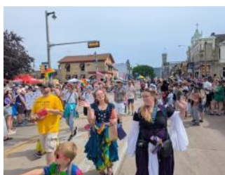
Several Mt Zion people wore renaissance faire outfits to bring more whimsy and joy.