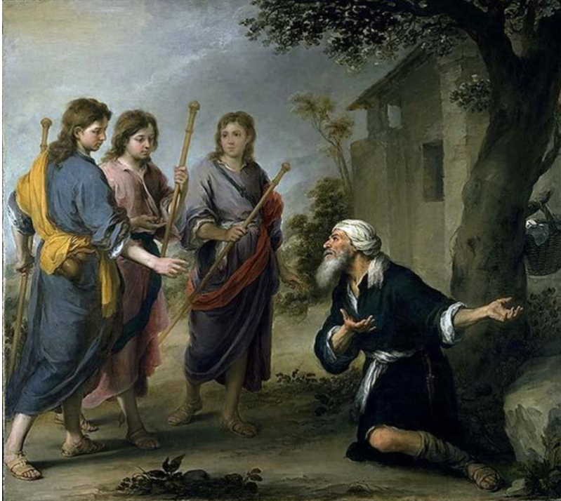
Abraham Receiving the Three Angels