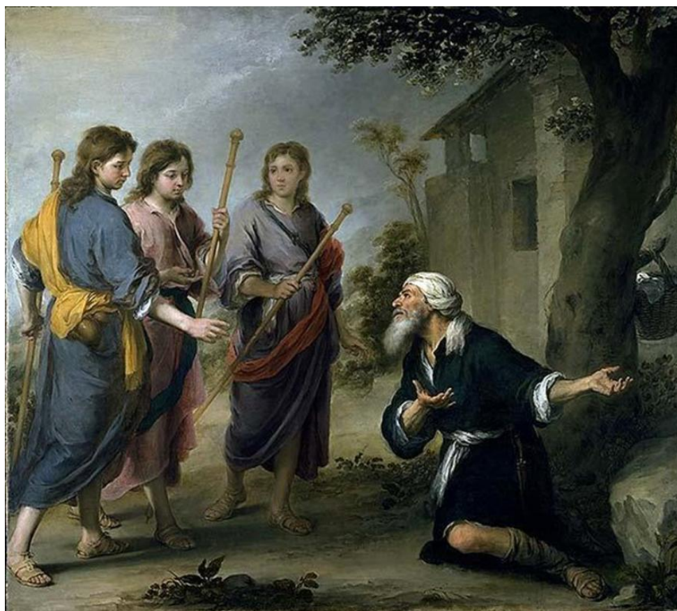
Abraham Receiving the Three Angels

Sunday, June 14, 2026 – 10 AM The 3rd Sunday after Pentecost