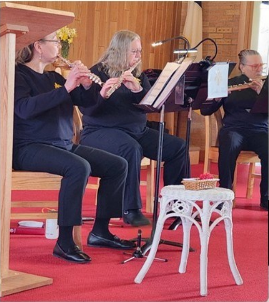
Garden Flutes trio provided beautiful music.