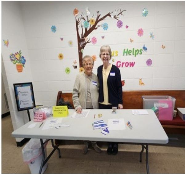
Minnesota River greeter April 11