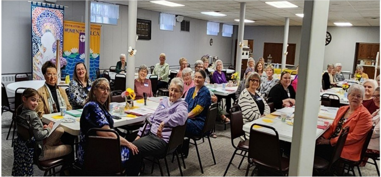
Ladies of Minnesota River on Saturday, April 11th at St. John Lutheran Church, Mapleton, MN.