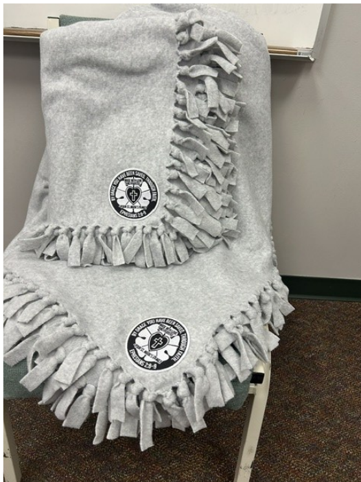
Blankets & prayer pockets for our recent graduates.