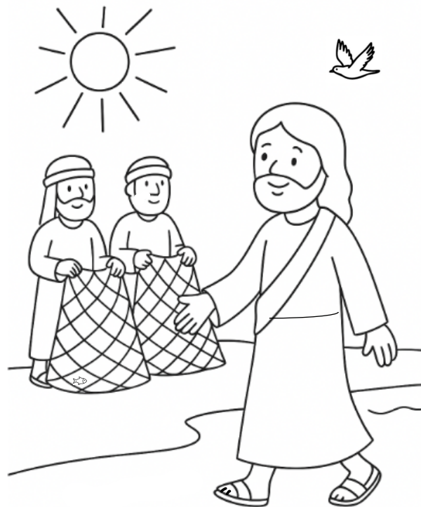
Jesus said, "Come."