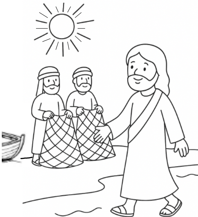
Jesus said, "Follow me."

Can you find 10 differences between the two pictures?