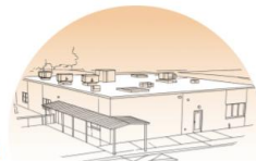
BUILDING FUND gifts go toward Northwest Roof repairs