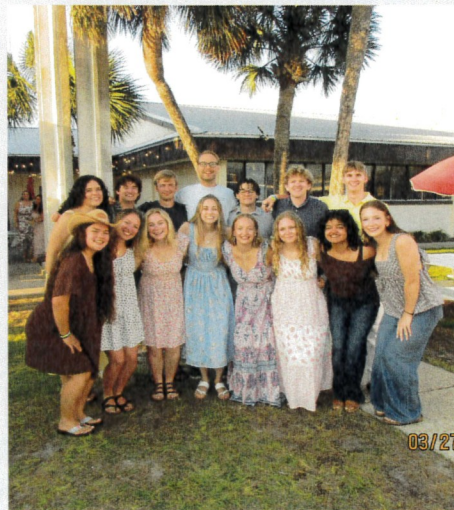
Left: The UWM crew at PCB! We had doubled our student attendance this year!

Because of your prayers and support, the Lord is at work using students to make the Gospel known to people on campus and around the country! I would love to connect with you soon to know how I can be praying for you!