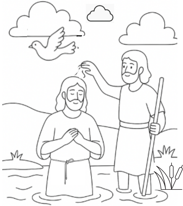
This is my Son, whom I love.