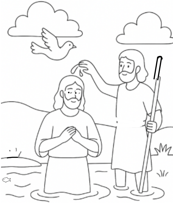
This is my Son, whom I love.

Can you find 10 differences between the two pictures?