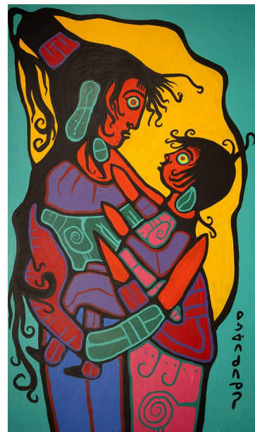
'In Honour of Mother' by Norval Morrisseau. © Official Estate of Norval Morrisseau

Blessed is he who comes in the name of the Lord. Hosanna in the highest.