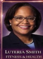
LUTERIA SMITH FITNESS & HEALTH