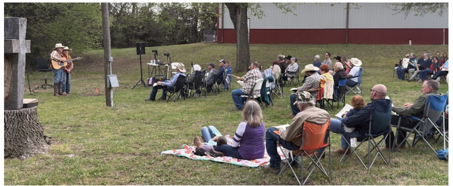
Falun Work Day