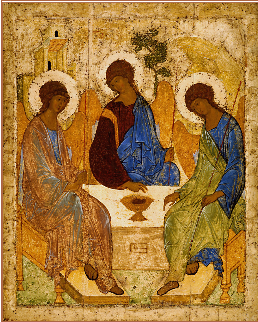
The Trinity, Icon by Andrei Rublev, circa 1420

"Touched by the Gospel, we seek to be instruments of God's Peace, for the sake of the World."