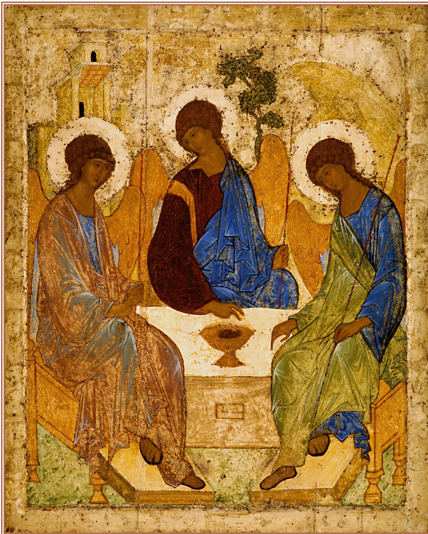
The Trinity, Icon by Andrei Rublev, circa 1420

The Trinity depicts the three angels who visited Abraham at the Oak of Mamre (Genesis 18:1-8), but the painting is full of symbolism and is interpreted as an icon of the Holy Trinity. At the time of Rublev, the Holy Trinity was the embodiment of spiritual unity, peace, harmony, mutual love and humility.