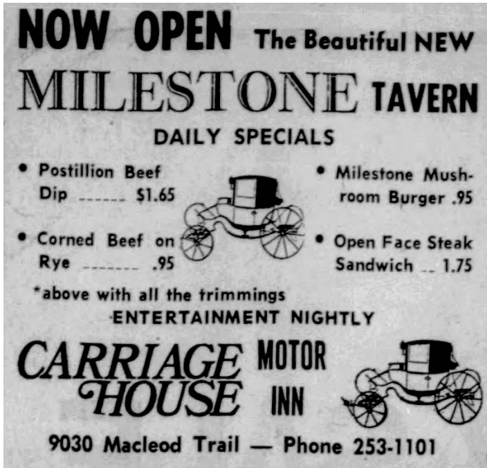
1968 Carriage House food prices