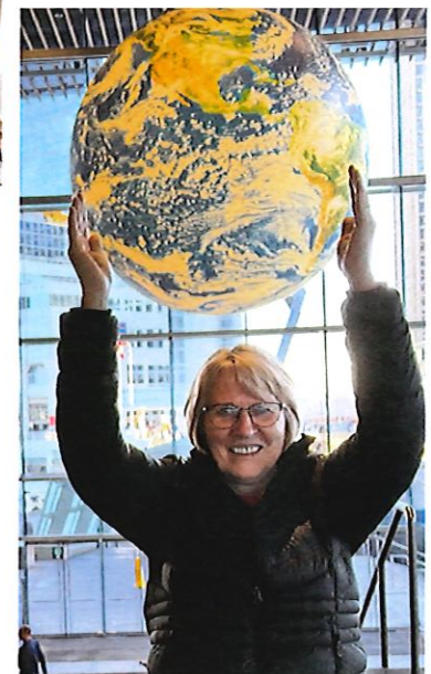
We don't need to carry the weight of the world on our shoulders because Jesus offers to bear our burdens.