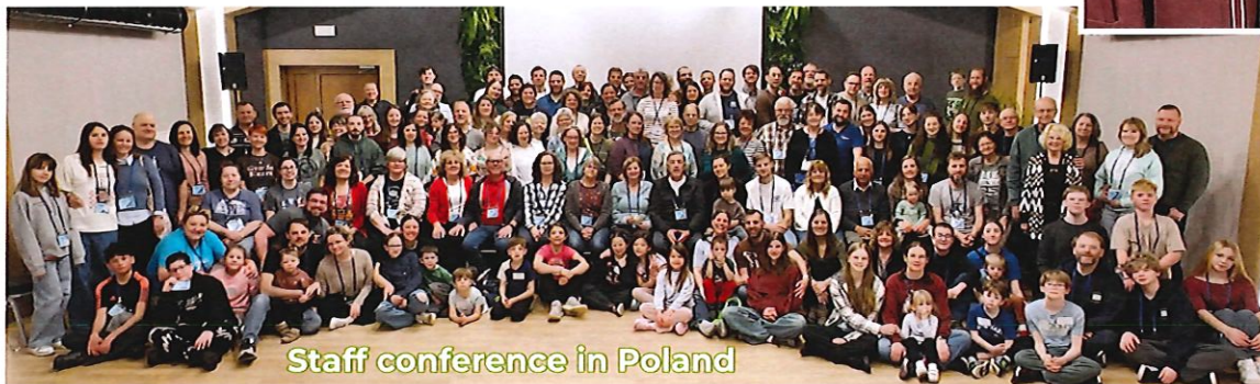
Staff conference in Poland