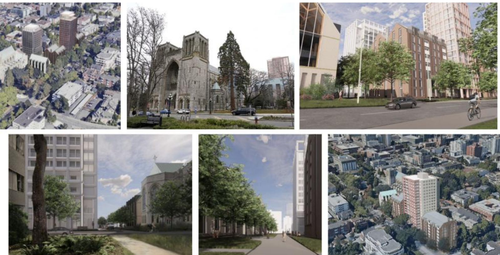
Figure 1, Cathedral Commons rezoning renderings (FaulknerBrowns Architects)