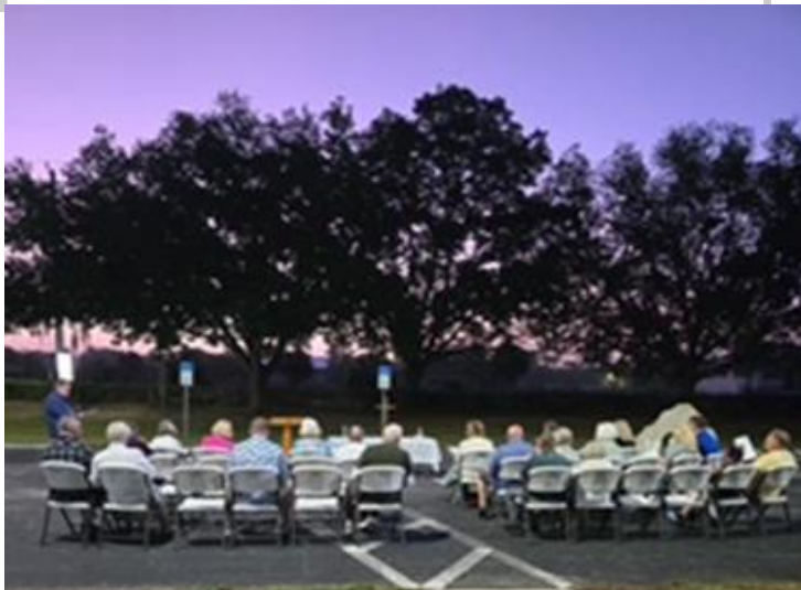
Pics from Easter Sunrise Service

May God Bless Each One of You As We Celebrate Your Special Day!