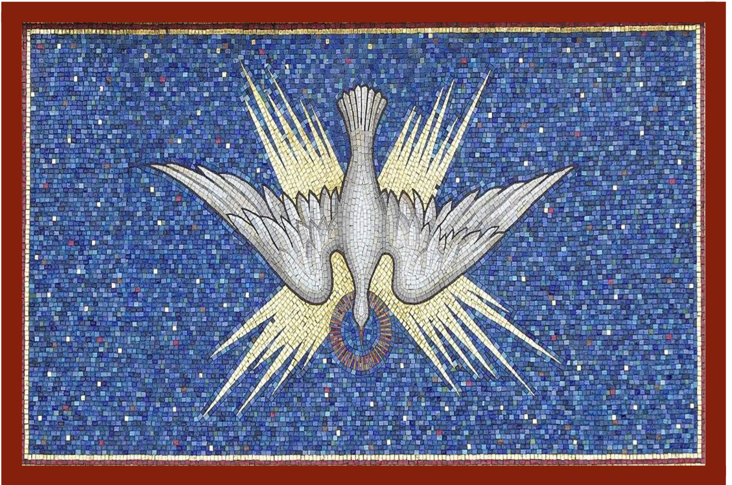
Ireland Muckross Church of the Holy Spirit 2025