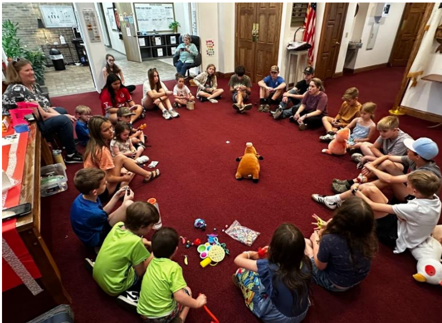
Young Youth and LCY at End of the Year Party