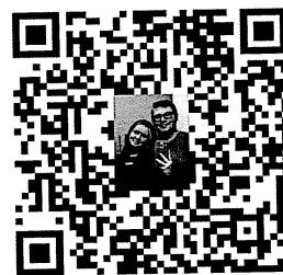
Gift Registry Link