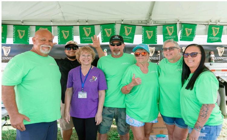
Just some of the “Beer Tent” crew!

Thank you all for your continued support of the festival and The Hammock House!