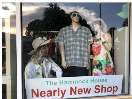
These are the places to be!

Volunteering at the Nearly New Shops is a great way to stay active, meet new people, and have lots of FUN!!!