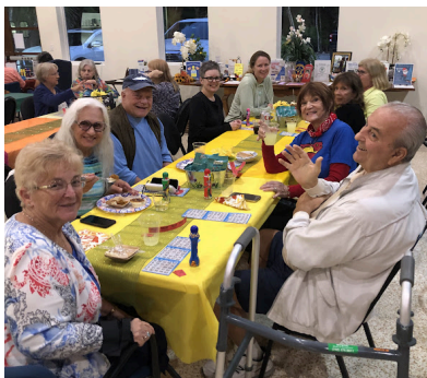
Bingo & Monopoly!

We all know and understand the crisis facing our community, the lack of affordable, safe and stable workforce housing leads to a strained workforce. We are called to help our neighbors. The Apartments @ 1655 help families find security, individuals gain peace of mind, and our community grows stronger. These successes would not be possible without your commitment and belief in our mission to Be The Hands and Feet of Christ in all that we do. Thank you all for your donations and support of our many FUNdraising efforts as we continue to raise money to pay for the completed repairs.