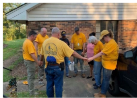
Photo far left: Your giving to the UMOF supports job training classes for immigrants, and other mission work, through CBF Georgia .