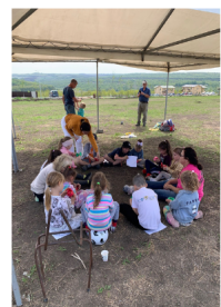
Photo right: Giving to the UMOF supports the CBF Global Missions relief efforts for Ukrainian refugees in Moldova, along with many others efforts.