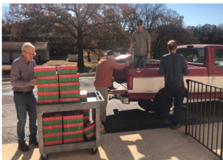
Photo left: The Tuesday Crew is ready to deliver OCC shoe boxes to the local Samaritan's Purse drop-off location in November 2025. FBC family and friends collected 132 shoe boxes for distribution around the world.