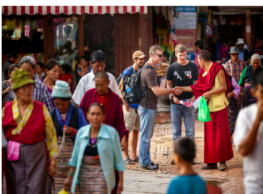
Photo left: Short-term mission volunteers give out invitations to an English-speaking club in Kathmandu, Nepal. The UMOF supports these mission efforts, along with many others, through giving to SBC's Lottie Moon Christmas Offering for international missions.