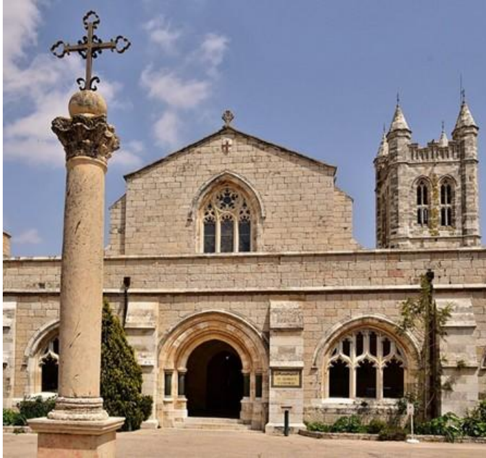
Cathedral Church of St. George's, Episcopal Diocese of Jerusalem.

34 Boucher St. East | Meaford, Ontario | N4L 1B9 519-538-1330 | office@christchurchanglican.ca | christchurchanglican.ca