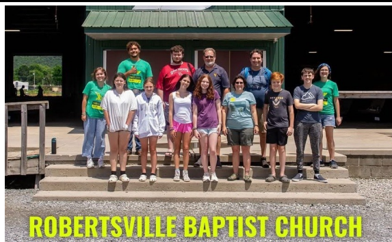
ROBERTSVILLE BAPTIST CHURCH