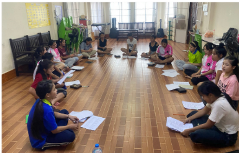
Our SE Asia girls in activity

We are so excited that construction for our SE Asia site safe homes has finished! We have three new homes and an activity center ready for the girls to move in. We praise God for this amazing building project to be brought to completion and that it would be used for God's glory and the future of many, many more girls and women at risk.