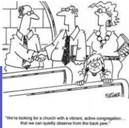
"We're looking for a church with a vibrant, active congregation... that we can quietly observe from the back pew."

"Know what? God knew me before I was born, but I can't quite remember Him."