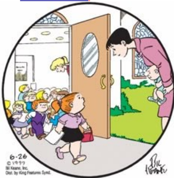
6-26 © 1997 Bill Keane, Inc. Dist. by King Features Synd.

"Know what? God knew me before I was born, but I can't quite remember Him."