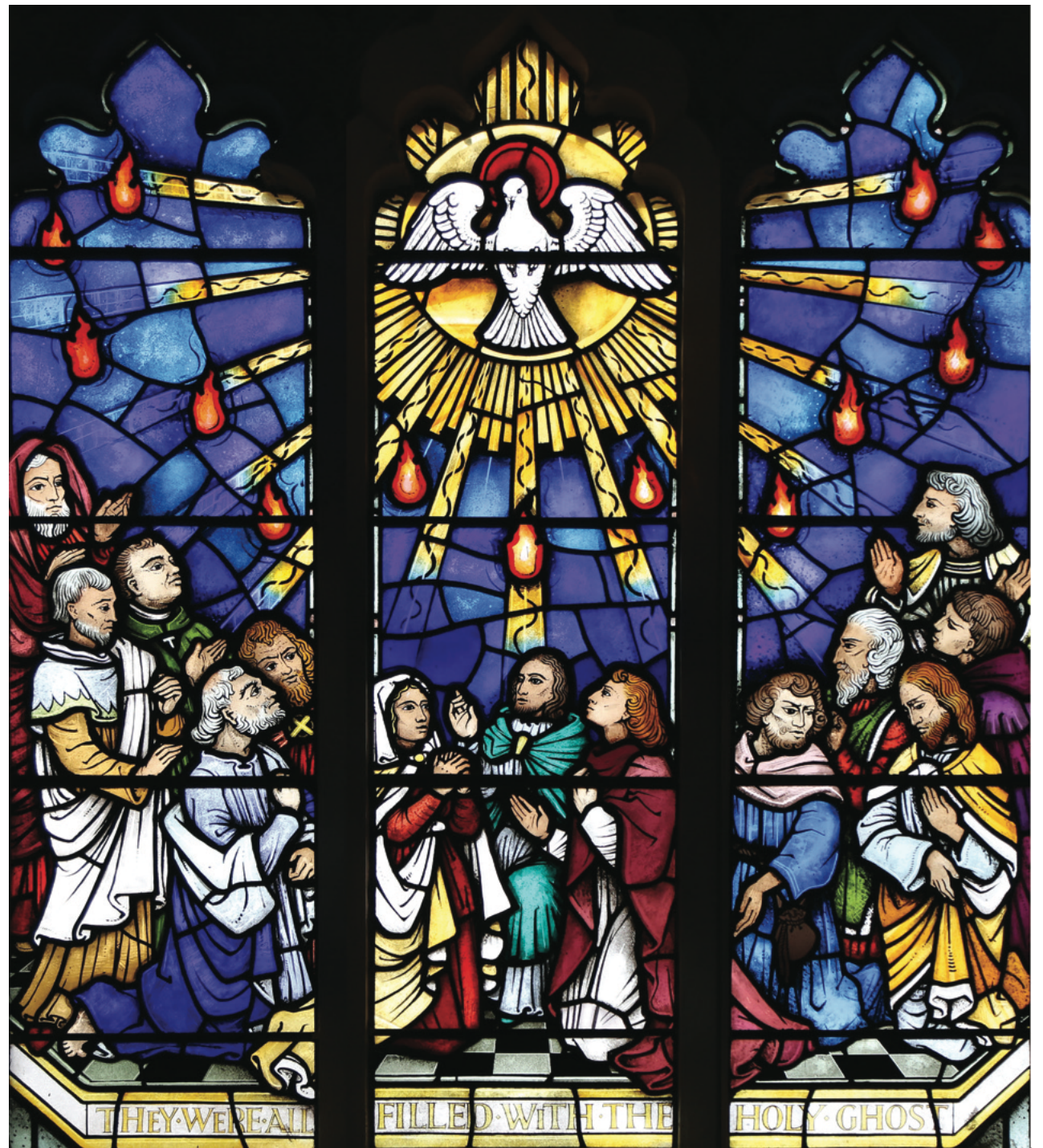
A stained glass window at St Mary's, Lambeth depicts the events of Pentecost.

...while to evil we cry out "Enough," to peace we whisper "Forever."