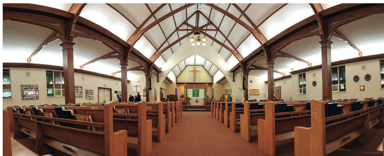
St. Paul's Cathedral, Kamloops.