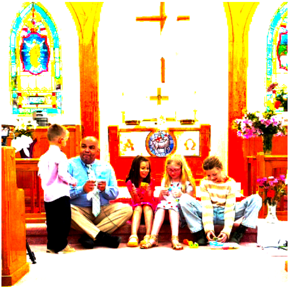
Moment with PH's Children