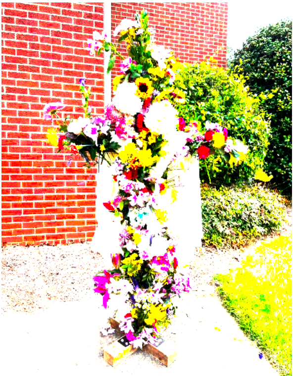
Easter at PH