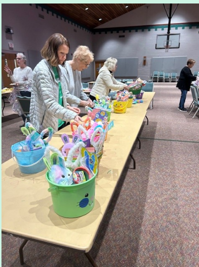
Assembly line of organizing donated items and baskets.