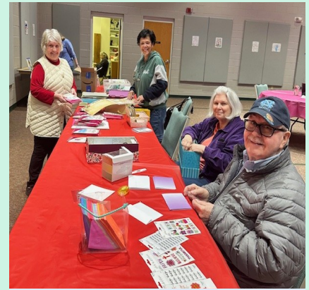
The Noteworthy project is growing and helping others feel the love of being remembered.