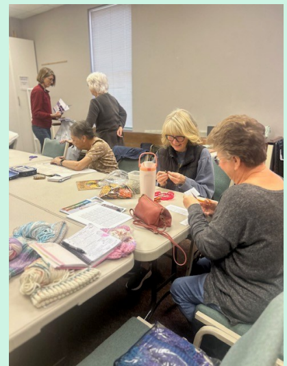
Always busy with pocket prayers & knitted hats.