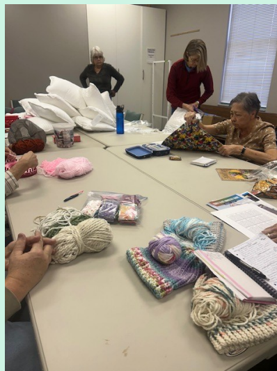
Pillowcases were made for pillows delivered to Bridge of Hearts. Pillows will go to