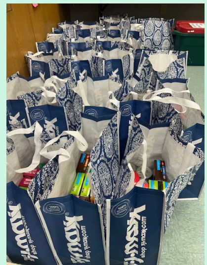
Hands Team provided Easter meal bags for 30 families in Swain County .