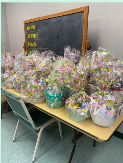
A few of the 100 plus Easter baskets for children at Living Waters Lutheran & surrounding