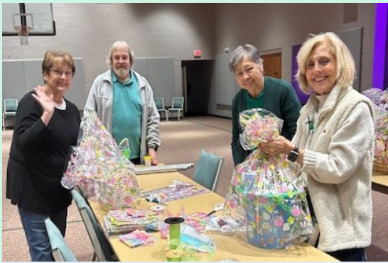
Each basket was covered with colorful plastic covering for safe travels.