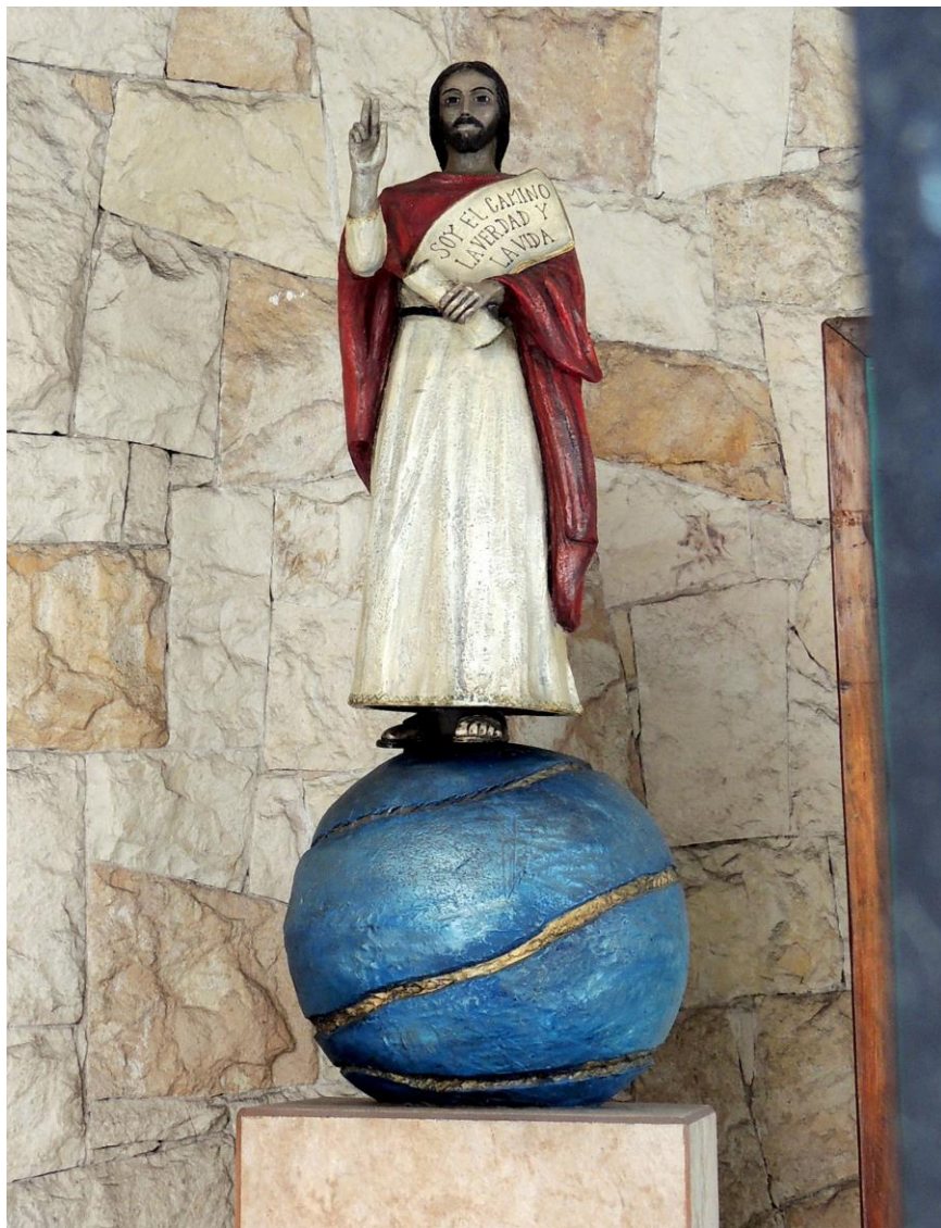
Christ as the Way, the Truth, and the Life anonymous 20 th -century sculpture in the Chapel of Divino Maestro, Mar del Plata, Argentina