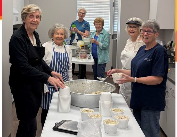
Preparing the chicken salad. Many hands make light work!

All women of the church are invited to participate in WOW. The next WOW meeting will be held on Saturday, May 16 at the church at 10 am. If the location and time change, an announcement will be made soon. WOW will not meet during June, July, and August. Thanks for supporting WOW.