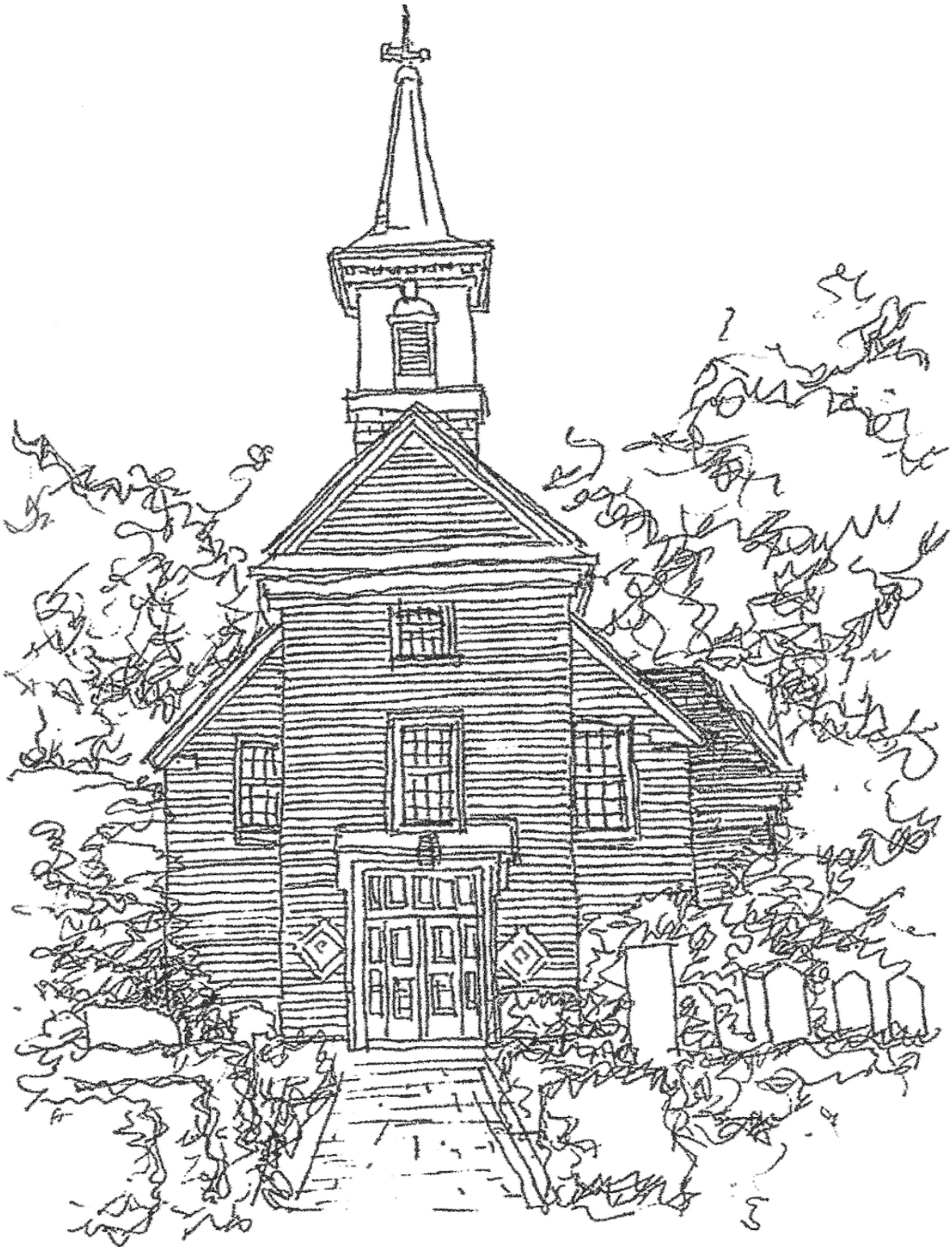
Gloria Dei (Old Swedes') Episcopal Church 2026 Annual Meeting Report May 3, 2026