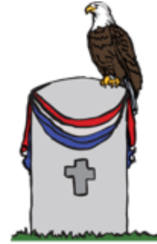
A Day for Remembering