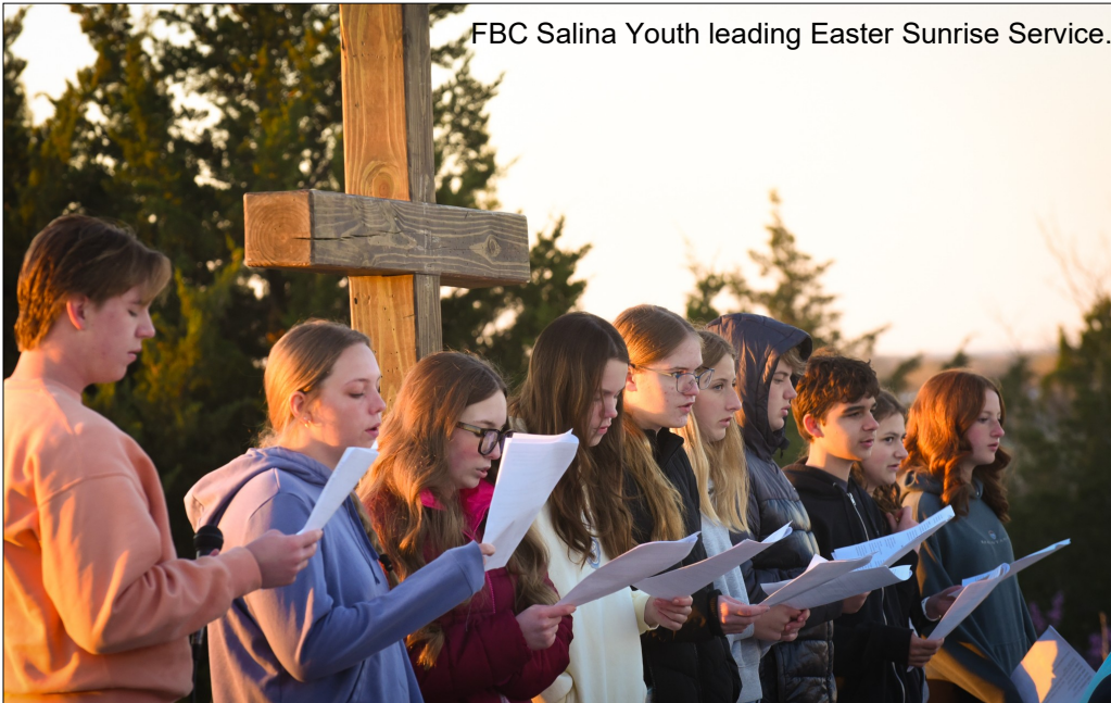
FBC Salina Youth leading Easter Sunrise Service.

The Secret Ingredient: A huge thank you to our kitchen volunteers, who serve every meal with a smile and keep us all fueled for ministry.