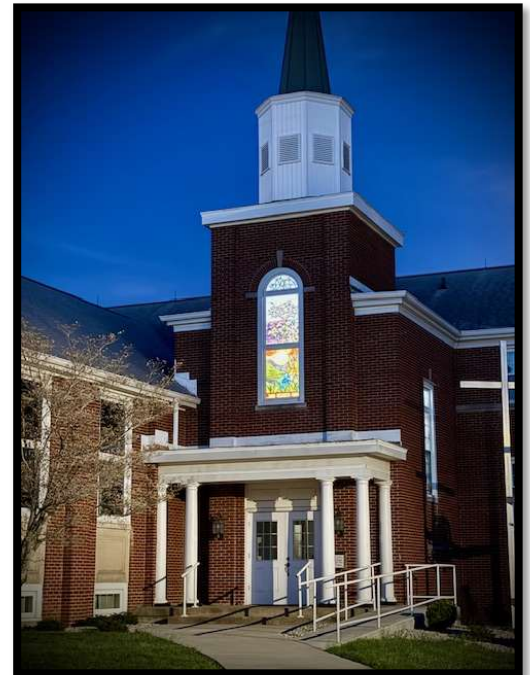
The beautiful stained glass windows in front illuminated during 2026 Holy Week.