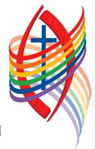
Crest of Affirm United

Comox United Church is a faith community within the United Church of Canada. Our central values appear at the bottom of this page. We are one of over 300 Affirming United Church Ministries across Canada, which means we affirm, include, and celebrate people of every age, race, belief, culture, ability, income level, family configuration, gender, gender identity, and sexual orientation in the life and ministry of our church, and proudly display the crest of the association of affirming churches known as Affirm United.