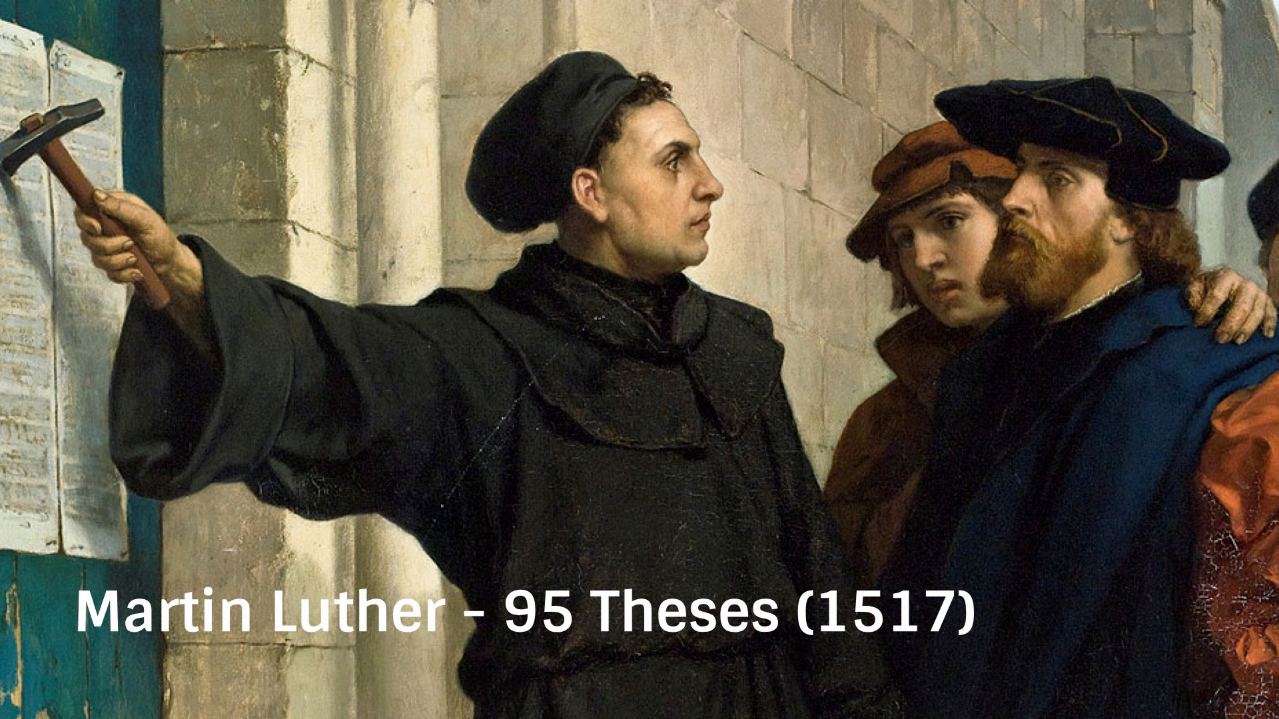
Martin Luther – 95 Theses (1517)