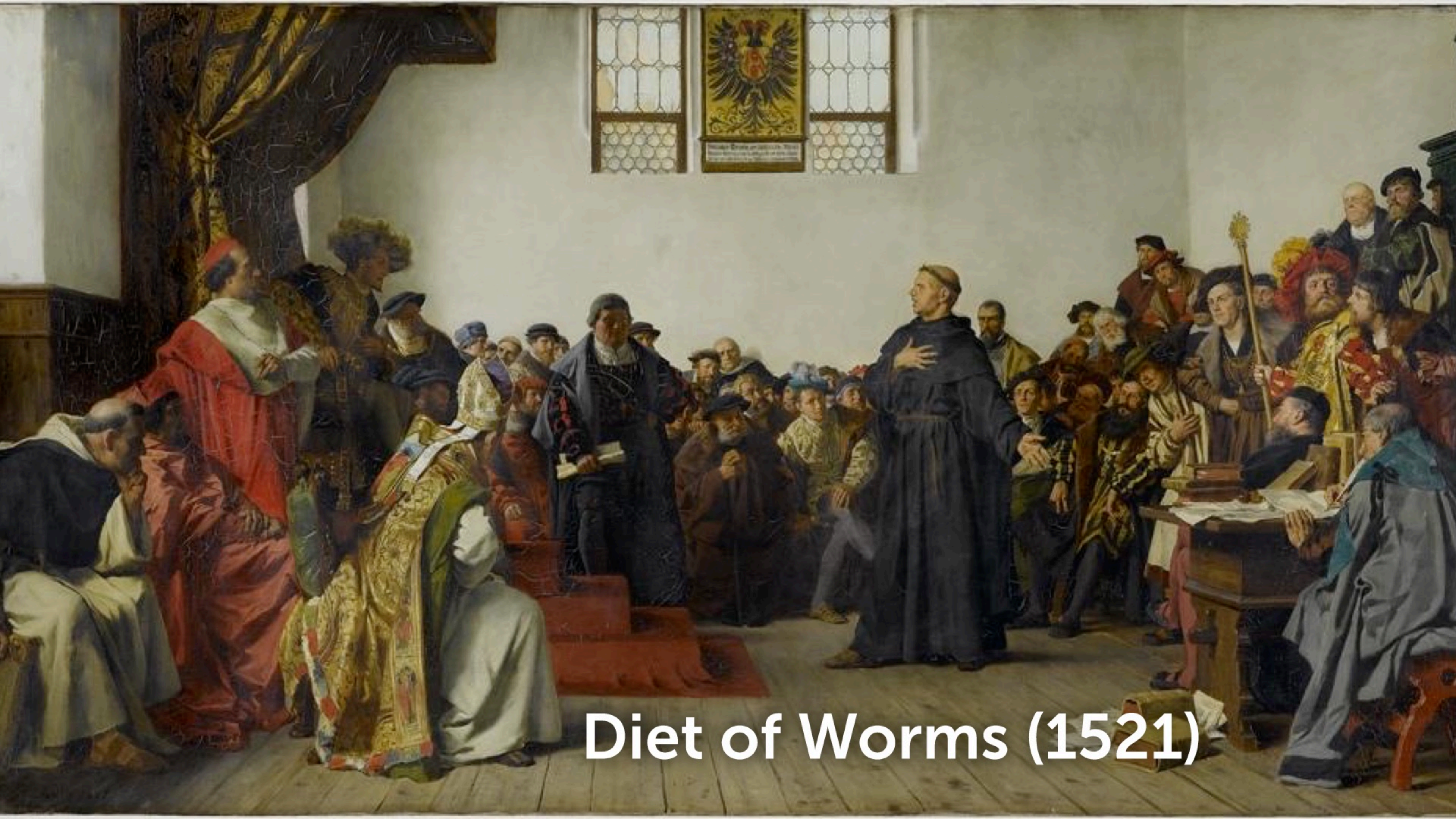
Diet of Worms (1521)