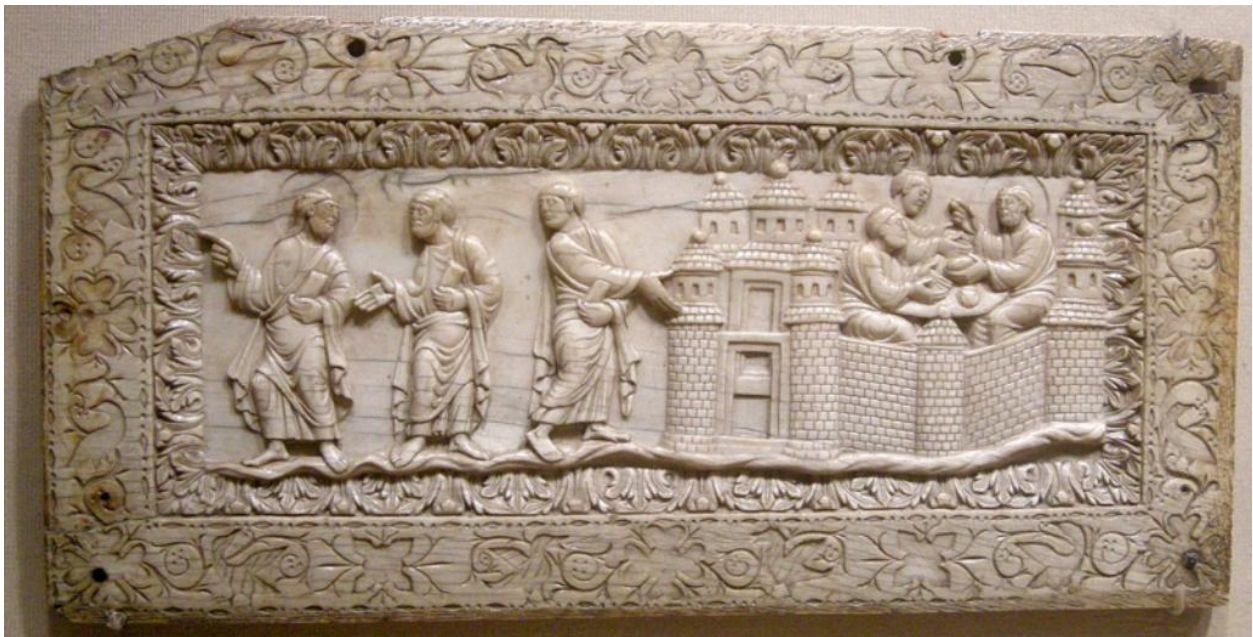
Road to Emmaus 1 Ivory Carving, ca. 850-900 .

Sunday, April 19, 2026 - 10 AM The 3 rd Sunday of Easter