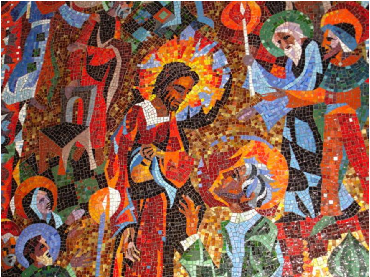
"Christ shows himself to Thomas"

Sunday, April 12, 2026 - 10 AM The 2 nd Sunday of Easter