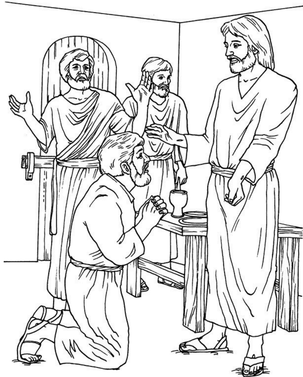
Jesus Appears! John 20:19-31

What would you tell someone who asked if you believe that Jesus really rose from the dead as the Son of God? How do you know that what you believe is true? Use the space below to reflect by writing or drawing a picture.